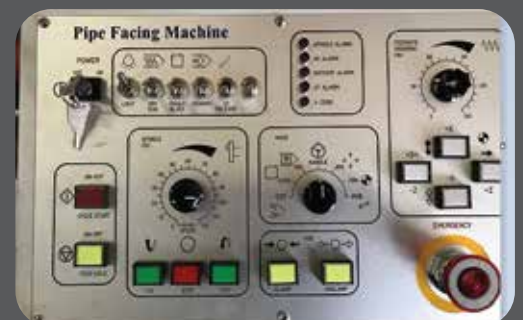
Standard, Simple Programming

Due to ongoing product development machine specifications can change at any time