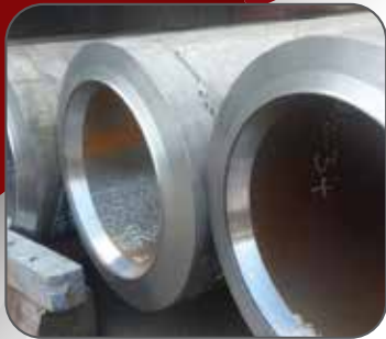
Complex Bevels Quickly Achieved