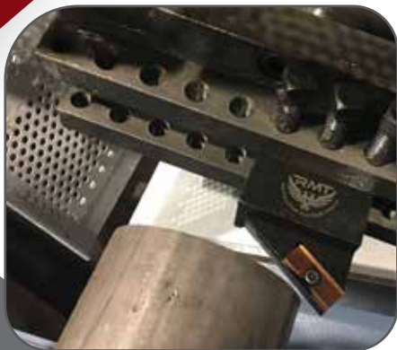
Complex Bevels with Hard Tooling