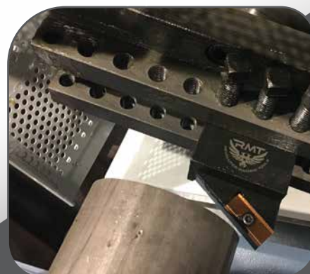
Complex Bevels with Hard Tooling

This compact beveling machine allows you to put any degree angled V bevels on your pipe or tube from sizes 1" - 8" OD. Super efficient and easy to setup and use, the PIPE SPOOL MASTER 8 can save your shop hours of beveling time. It's a necessity for any shop working with small size pipe.