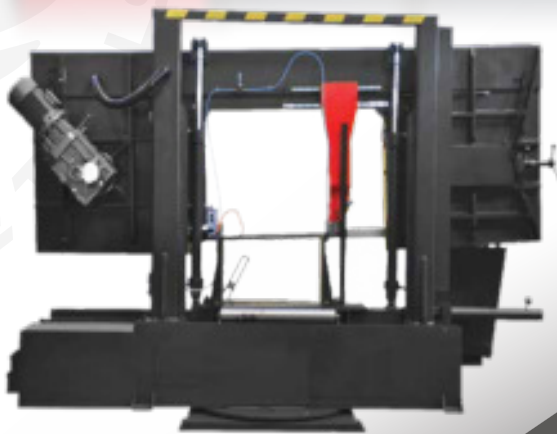
Optional Miter Base