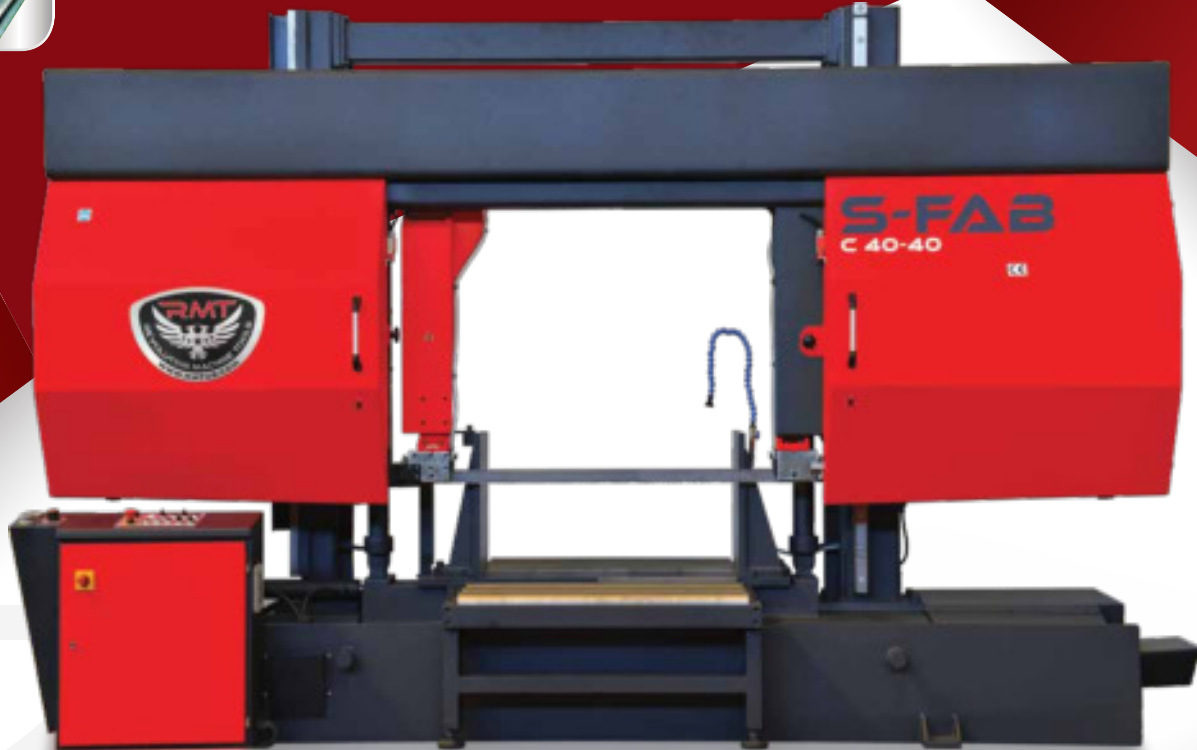
Semi-Automatic Column Type Bandsaw