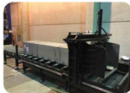
Optional 10 ft servo feeding shuttle stroke