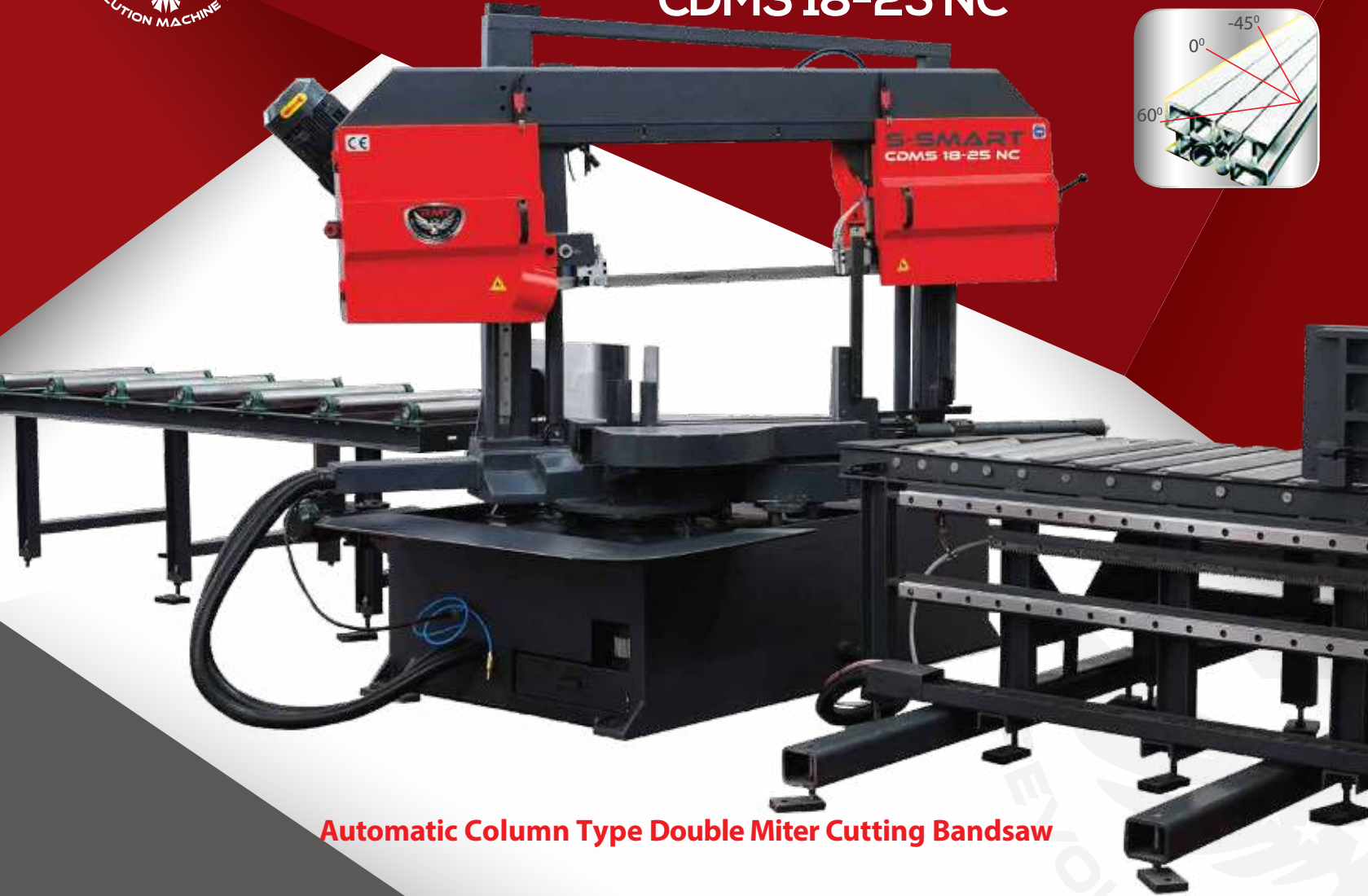
Automatic Column Type Double Miter Cutting Bandsaw